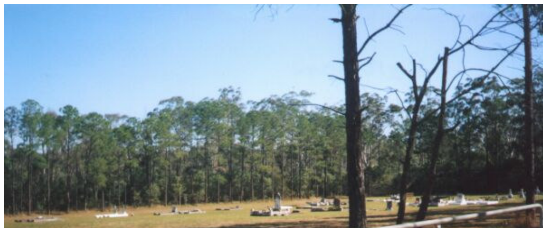
Carbrook Lutheran Cemetery

No one can confidently say that he will still be living tomorrow - Euripides.