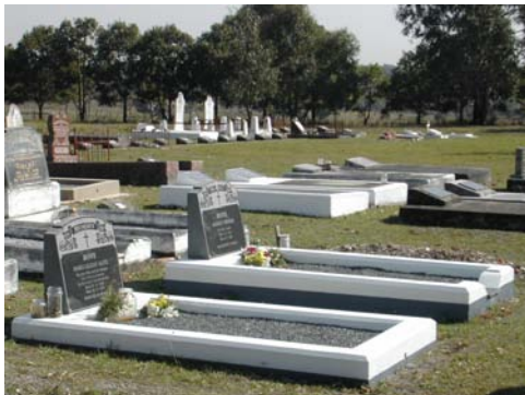
Bethania Lutheran Cemetery